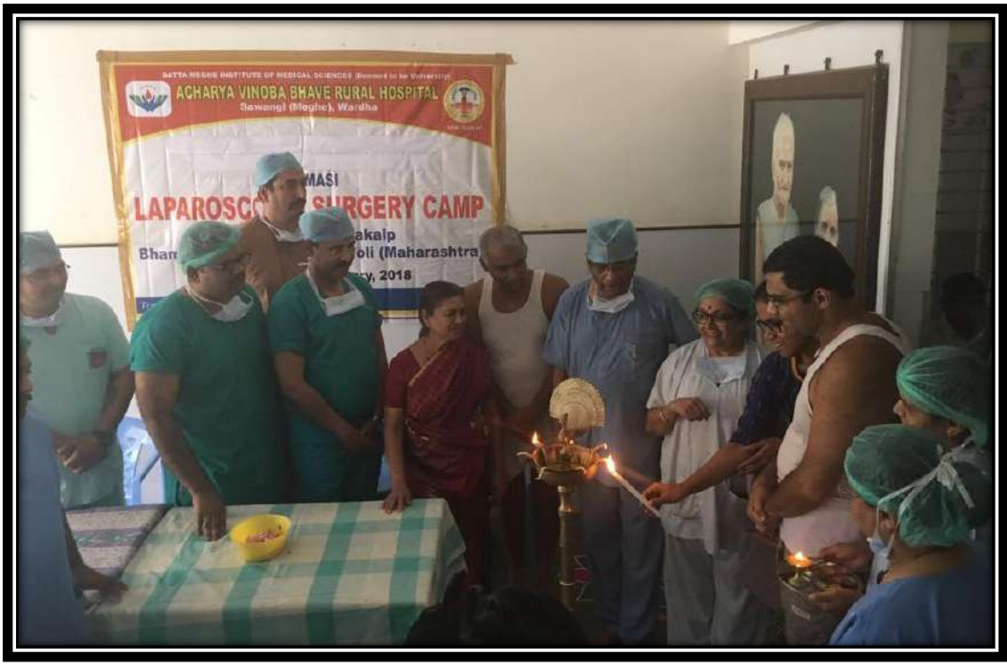
Lok Biradari Prakash, Hemalkasa – Laparoscopic Surgery Camp