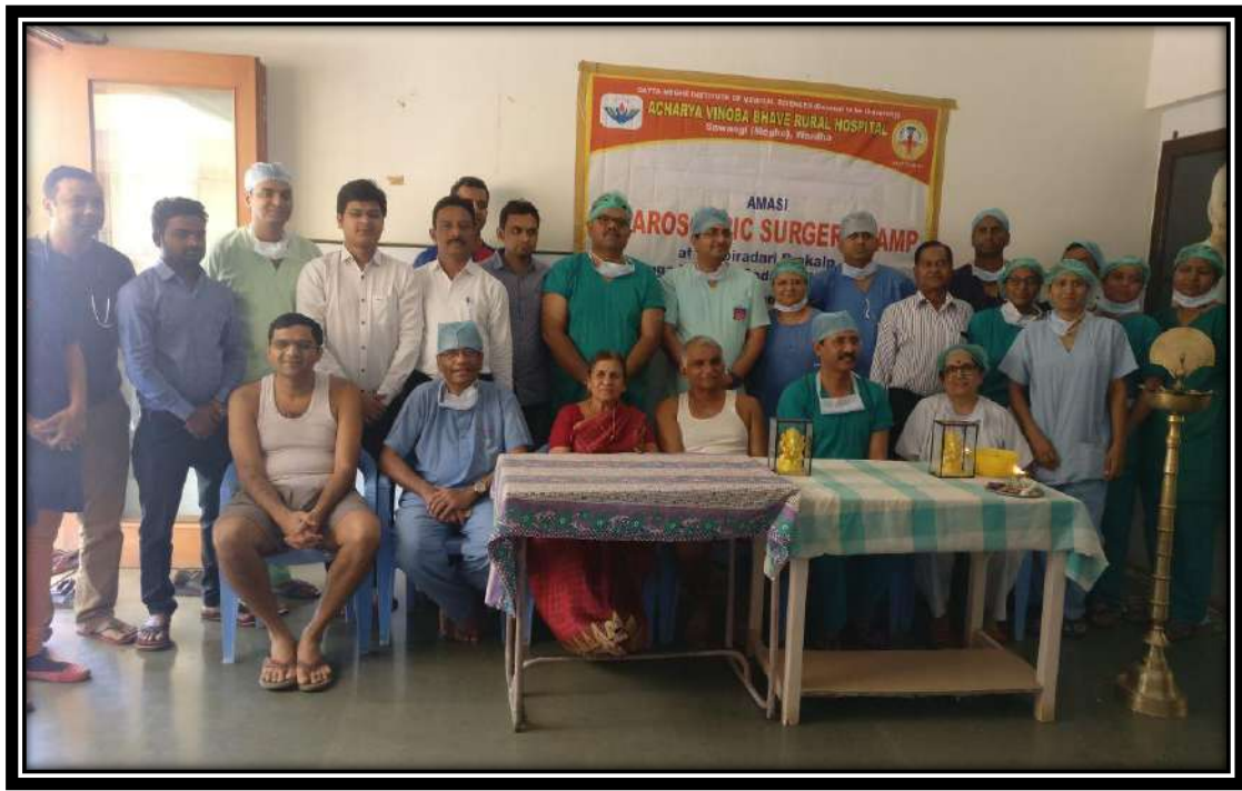
Lok Biradari Prakash, Hemalkasa – Laparoscopic Surgery Camp