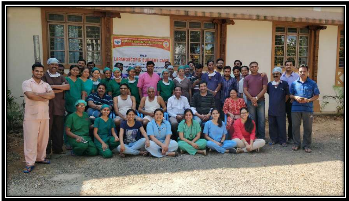
Lok Biradari Prakalp, Hemalkasa – Laparoscopic Surgery Camp

Asst. Secretary, Maharogi Sewa Samiti, Warora